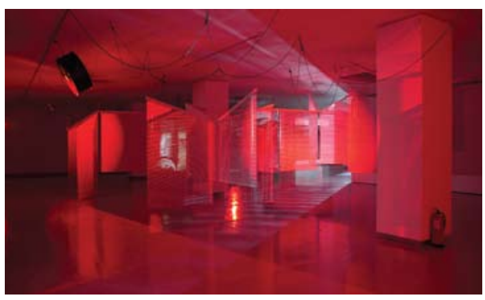
room installation of venetian blinds, hanging mirrors, fans, infrared-heating element, microphone and speakers, installation views at Sala Rekalde, Bilbao.