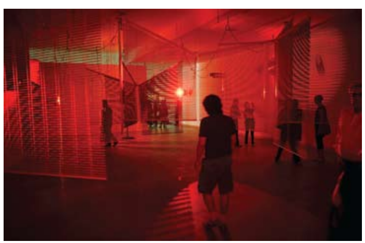
YEARNING MELANCHOLY RED, 2008, site-specific installation, aluminum venetian blinds (shiny white, faux-wood), mirror, four Martin mini Mac 250 moving lights, three sets of infrared heaters and fans, drum kit, cables, dimensions variable. Installation view at REDCAT Gallery, Los Angeles, 2008.