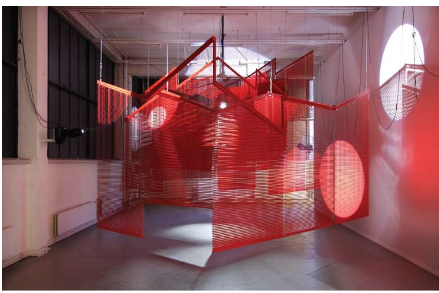
MOUNTAINS OF ENCOUNTER, 2008, spotlights, red venetian blinds, installation view at the Kunstverein, Hamburg, 2008.