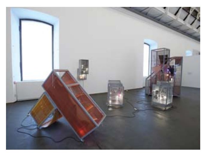
DOUBLES AND COUPLES - VERSION TURIN , 2008, lights, steel, colored venetian blinds, dimensions variable. Installation view at the 2nd Turin Triennale, 2008.

overt references in the sculpture. The red blinds might allude to the Red Army, the two roving spotlights to San and Wales' furtive encounters or those watching out for them, but the narrative is more a starting point for her abstraction than a key to its meaning.