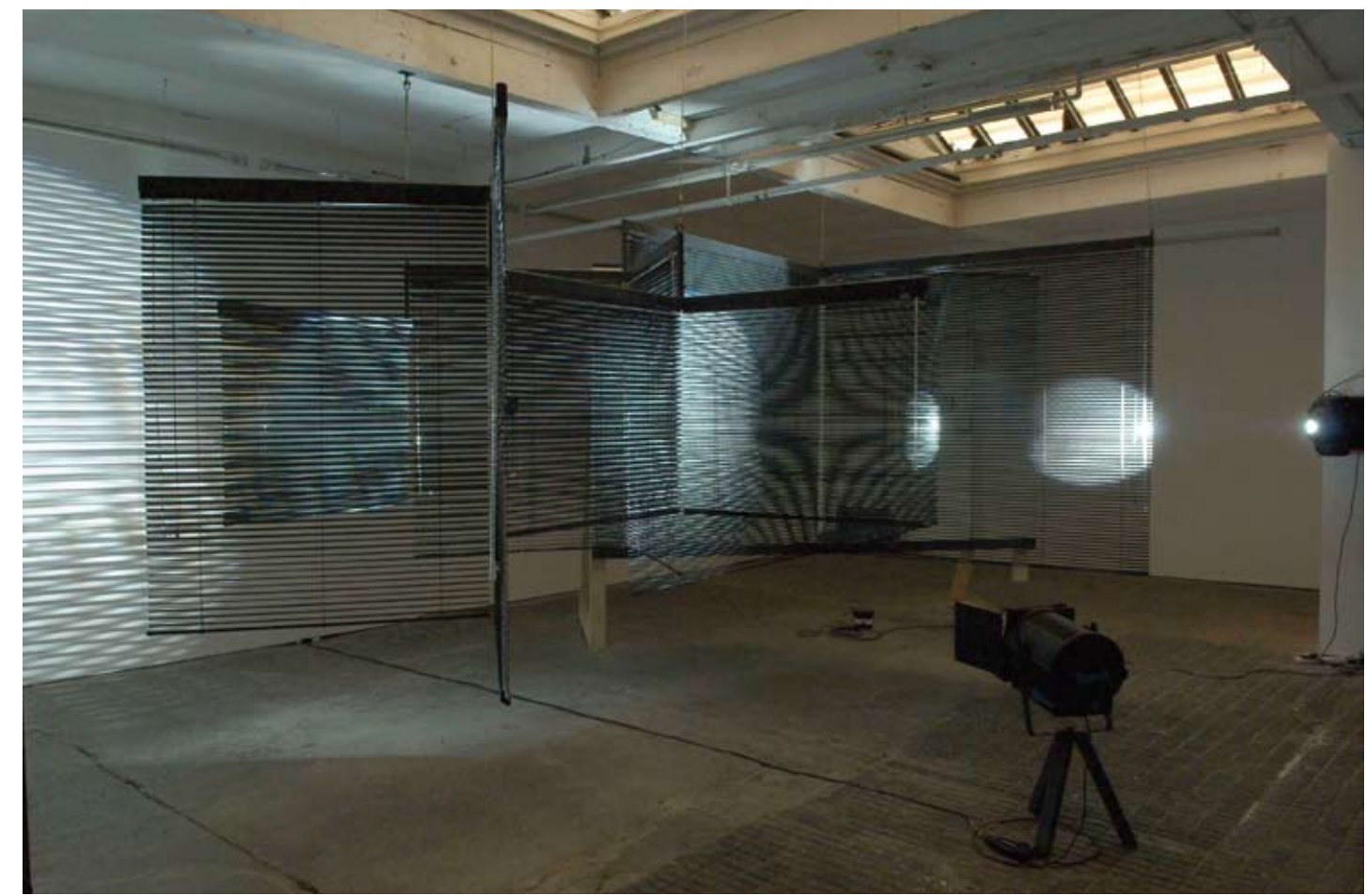
LETHAL LOVE, 2008, black-painted aluminum blinds, spotlight, mirror, scent atomizer, installation view at Cubitt, London, 2008.

for visitors to use, introducing an added aural and interactive element.