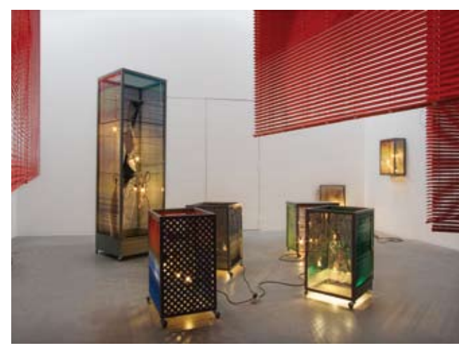
5, RUE SAINT-BENOÎT , 2008, aluminum venetian blinds, steel frame, metal plates, casters, bulbs, cables, yarn, vinyl, dimensions variable. Installation view at Portikus, Frankfurt, 2008.

The room was alternately dark, light (at times tinged with red from the infrared heaters), warm, humid and breezy. Here, three sets of black venetian blinds hung from the ceiling to delineate a space that housed a screen on which Yang projected two 18-minute videos. Unfolding Places (2004), shot in London and Seoul, shows a stream of loosely connected images including tunnels, street scenes, the corners of rooms and origami animals strewn in street puddles with a first-person voice-over narrating