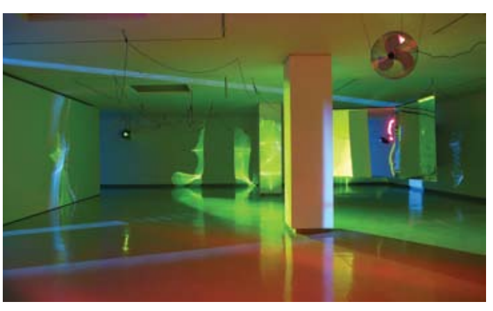
SERIES OF VULNERABLE ARRANGEMENTS - SHADOWLESS VOICE OVER THREE, 2008, three-