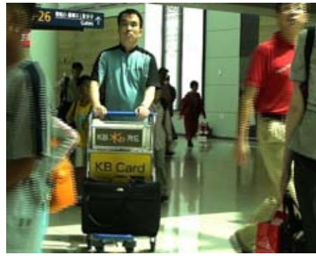
Unfolding Places 2004 video (color, sound); 18:11 minutes Voice-over: Helen Cho; Restrained Courage 2004 video (color, sound); 18:37 minutes Voice-over: Camille Hesketh; Squandering Negative Spaces [TK]