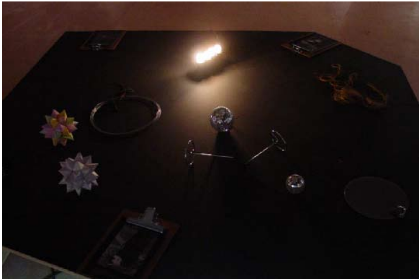
Series of Vulnerable Arrangements 2006 [various devices of senses?] Installation view at BAK, Utrecht, [TK year]